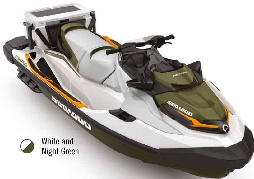
White and Night Green