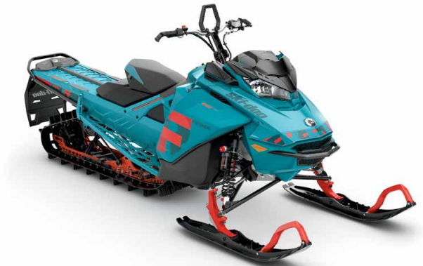
FREERIDE™ 154 850 E-TEC® shown