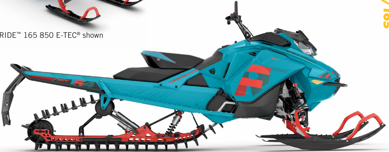
FREERIDE™ 154 850 E-TEC® shown