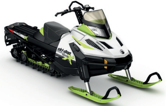
TUNDRA™ Xtreme 600 H.O. E-TEC® shown