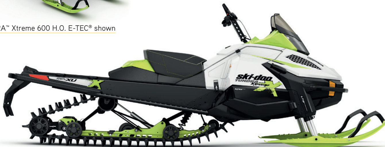
TUNDRA™ Xtreme 600 H.O. E-TEC® shown