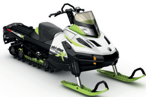
TUNDRA™ Xtreme 600 H.O. E-TEC® shown