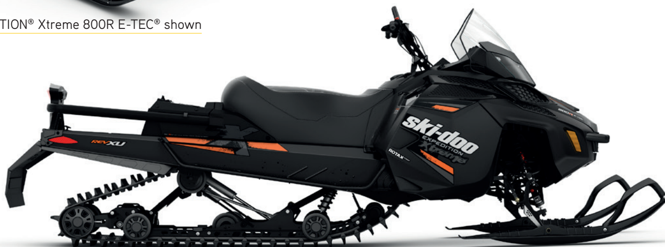
EXPEDITION® Xtreme 800R E-TEC® shown