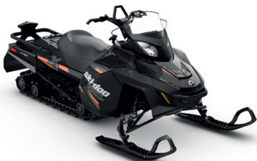
EXPEDITION® Xtreme 800R E-TEC® shown