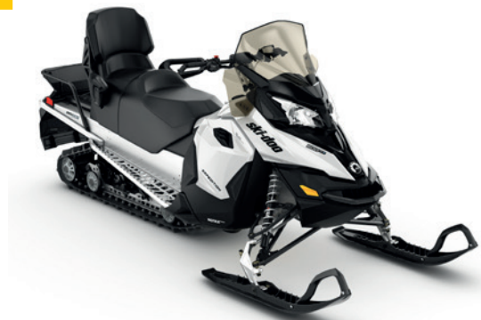
600 ACE shown