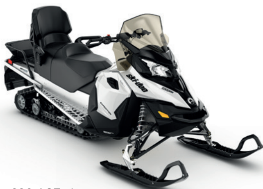
900 ACE shown