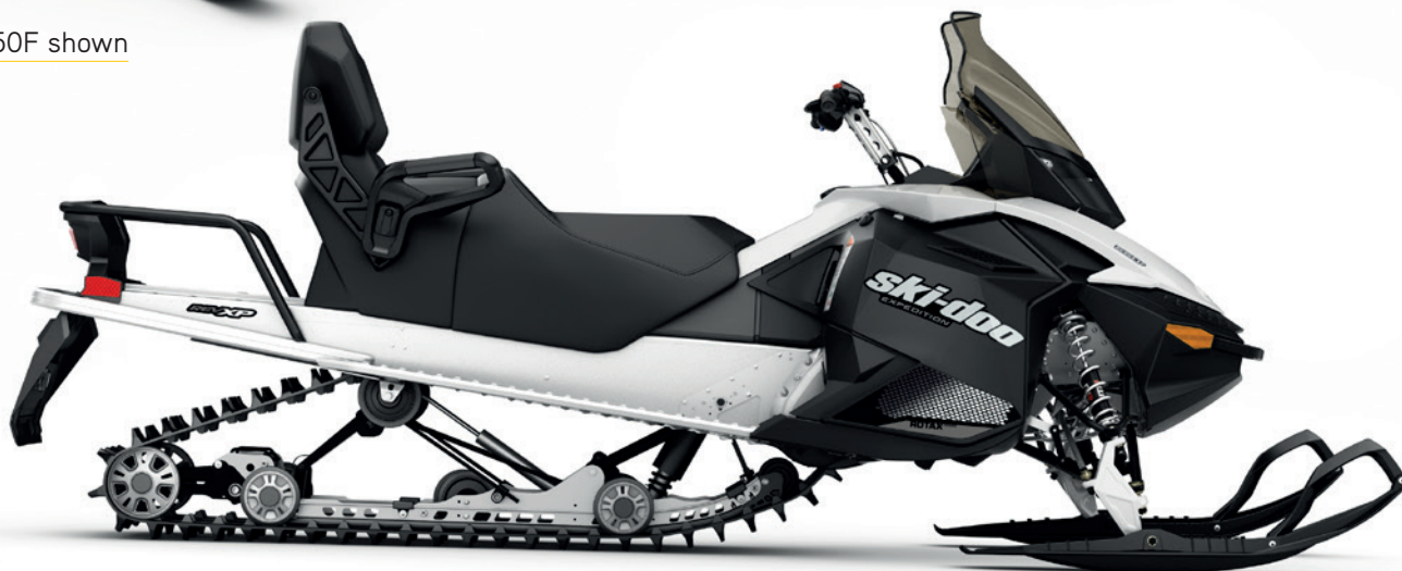
SPORT 550F shown