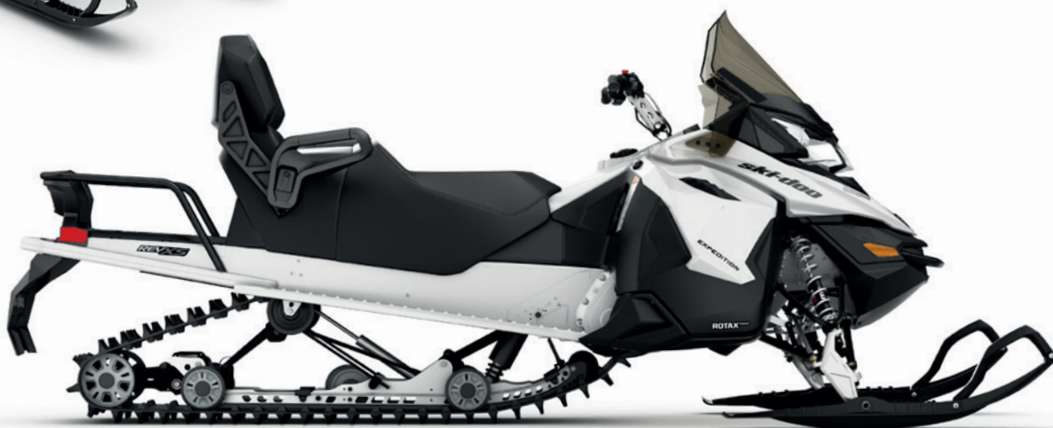
900 ACE shown