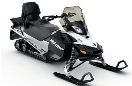
SPORT 550F shown