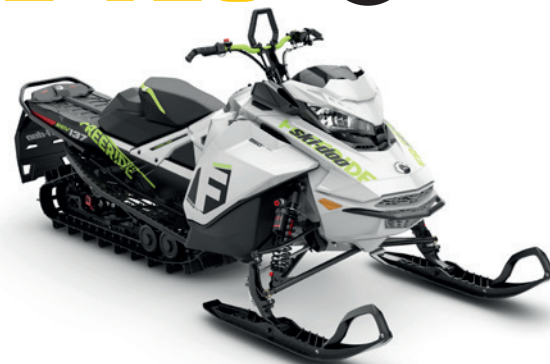
FREERIDE™ 137 850 E-TEC® shown