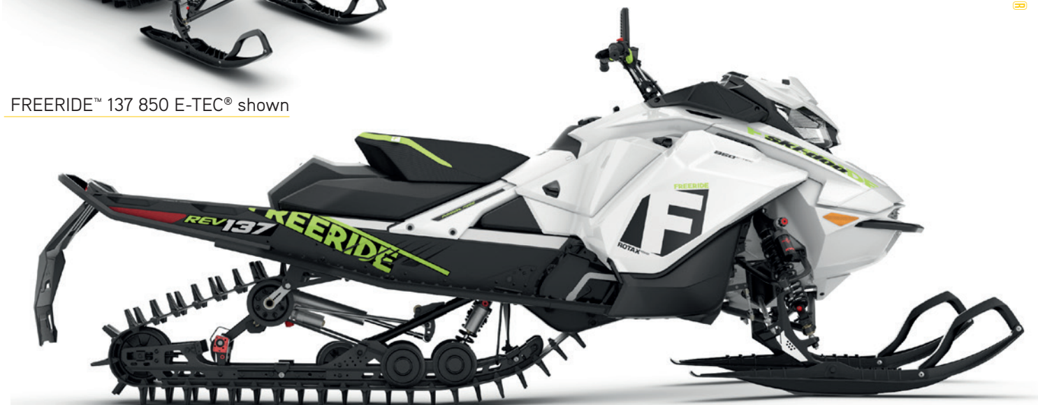
FREERIDE™ 137 850 E-TEC® shown