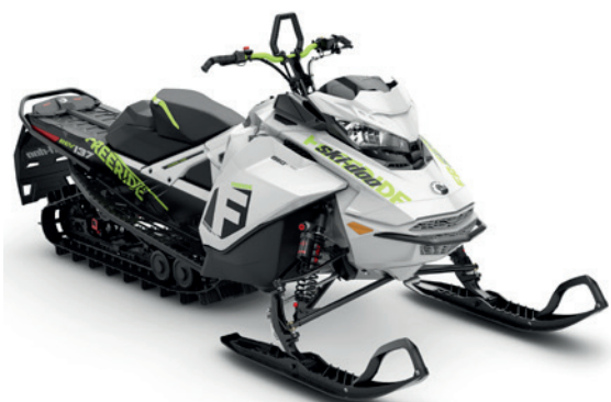
FREERIDE™ 137 850 E-TEC® shown