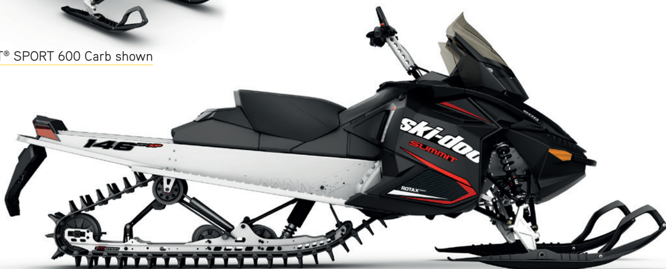
SUMMIT® SPORT 600 Carb shown