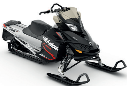
SUMMIT® SPORT 600 Carb shown