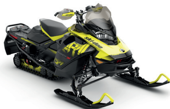
MXZ ® X 850 E-TEC ® shown