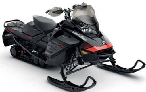
MXZ® X 850 E-TEC® shown