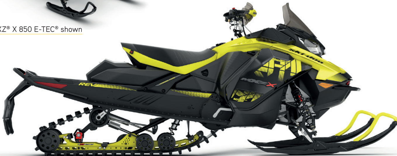
MXZ® X 850 E-TEC® shown