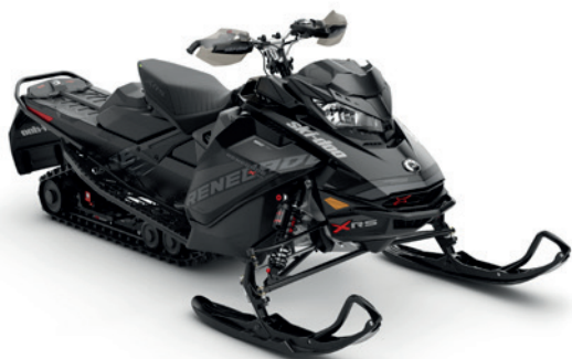
RENEGADE® X-RS® 850 E-TEC® shown