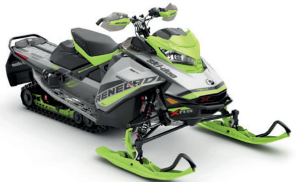
RENEGADE ® X-RS ® 850 E-TEC ® shown