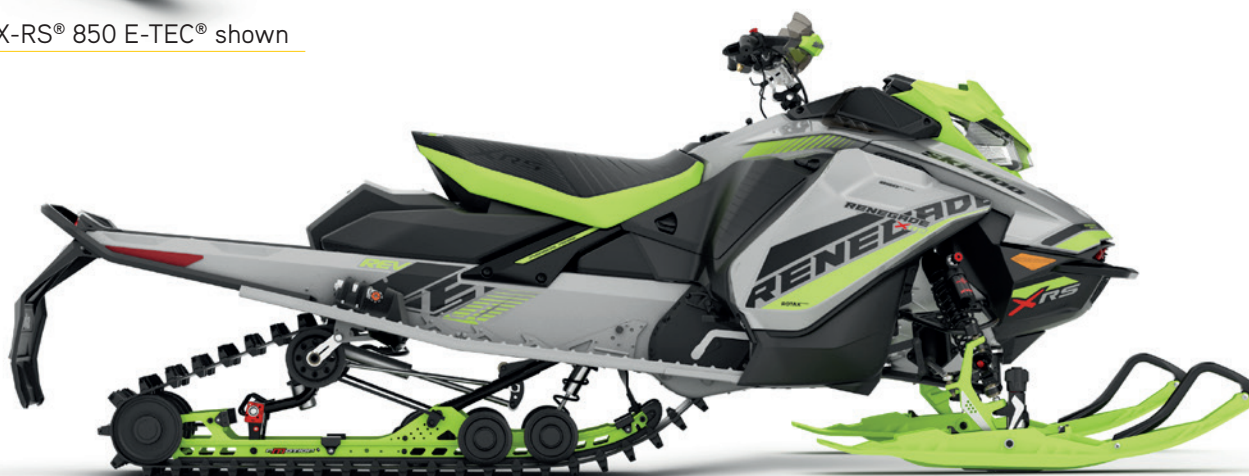
RENEGADE® X-RS® 850 E-TEC® shown