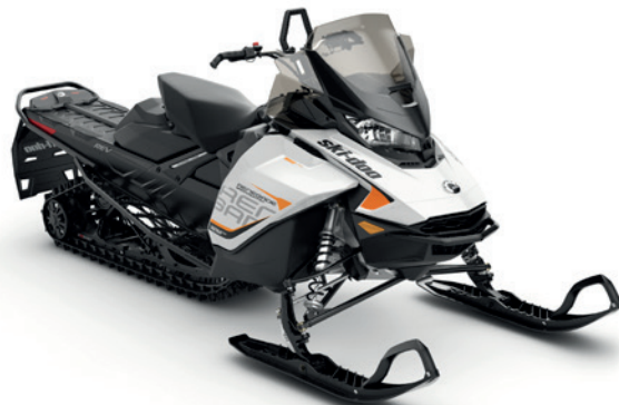
RENEGADE ® BACKCOUNTRY ™ 850 E-TEC ® shown