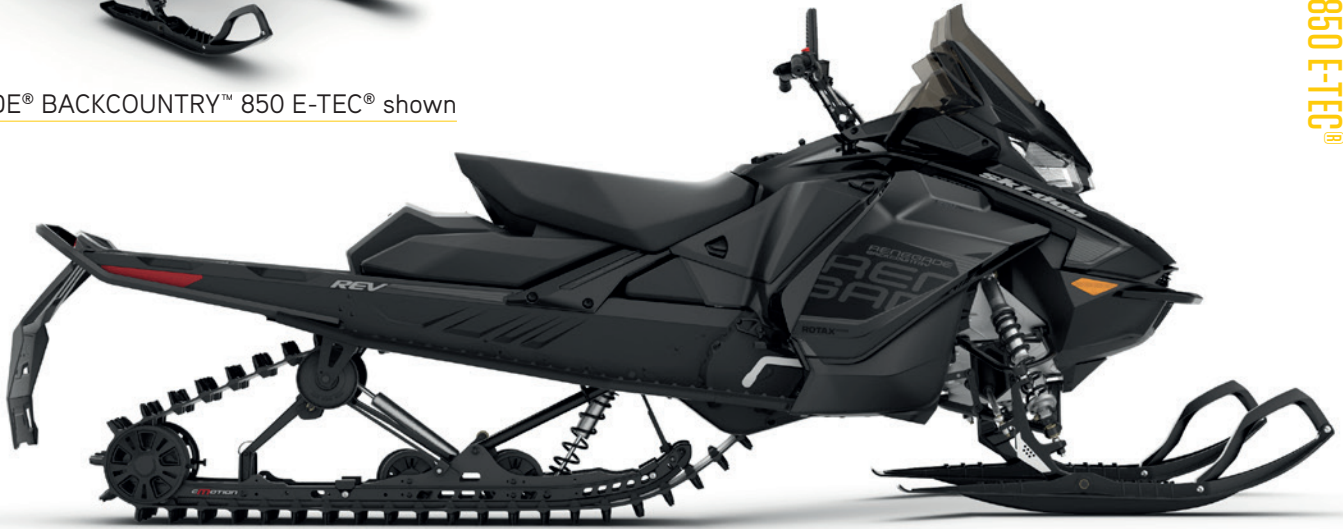
RENEGADE® BACKCOUNTRY™ 850 E-TEC® shown