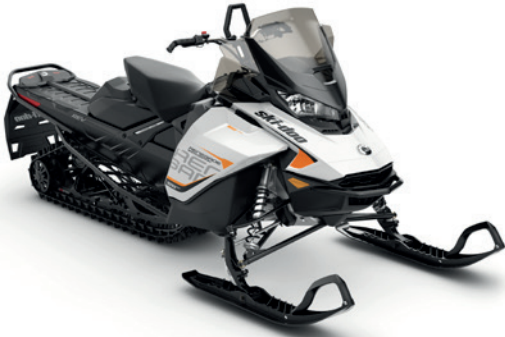
RENEGADE® BACKCOUNTRY™ 850 E-TEC® shown