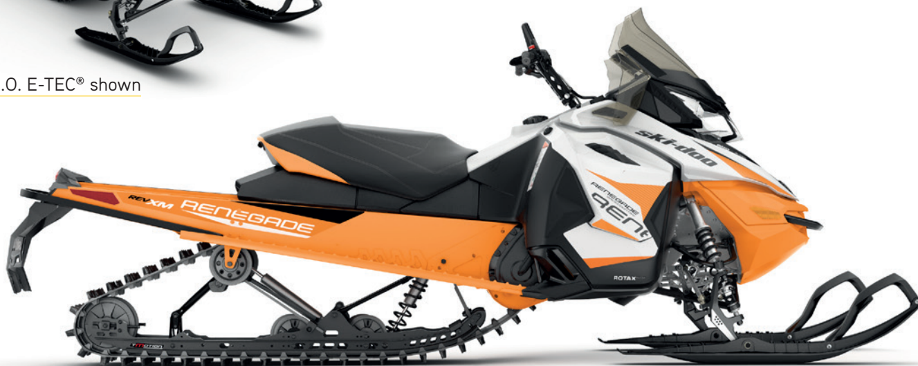
600 H.O. E-TEC® shown