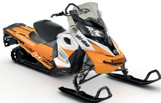
600 H.O. E-TEC ® shown