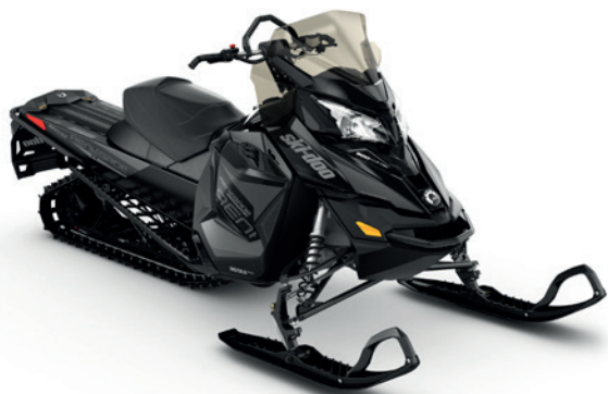
600 H.O. E-TEC® shown