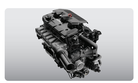
ROTAX® 1630 ACE™ - 325 ENGINE

An innovative, industry-first system that allows you to free your pump of weeds and debris with intuitive handlebar-activated controls.