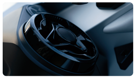
BRP Audio - premium system

USB port, watercraft cover, storage bin organizer, knee pads, exclusive coloration and more