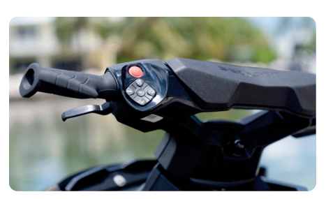
iDF - Intelligent Debris Free system

A factory-installed, truly waterproof Bluetooth<sup>†</sup> audio system for an extra dose of fun and entertainment on the water.