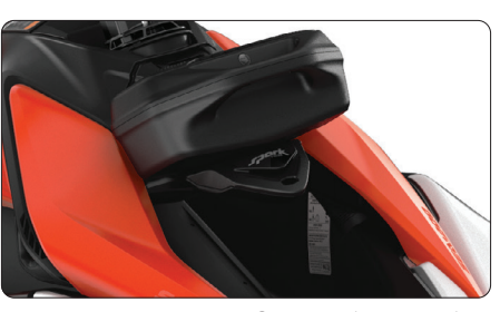
BRP Audio - Portable System (optional) The BRP audio-portable system provides higher quality sound on and off the water featuring Concert, Ride and Home mode. Equiped with a heavy duty mounting bracket.