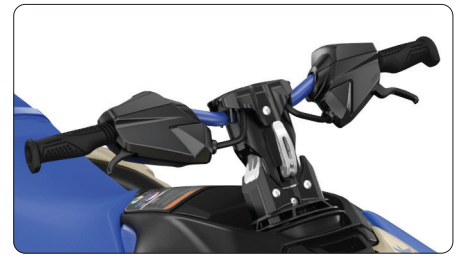
iBR * (Intelligent Brake & Reverse) Exclusive to Sea-Doo<sup>*</sup>, iBR* stops the watercraft sooner and provides more control and maneuverability at low speeds and in reverse.

©2024 Bombardier Recreational Products Inc., (BRP). All rights reserved. (1), TM and the BRP logo are trademarks of Bombardier Recreational Products Inc. or its affiliates. All product comparisons, industry and market claims refer to new sit-down PWC with 4-stroke engines. Watercraft performance may vary depending on, among other things, general conditions, ambient temperature, altitude, riding ability and rider/ passenger weight. Testing of competitive models done under identical conditions. Because of our ongoing commitment to product quality and innovation, BRP reserves the right at any time to discontinue or change specifications, price, design, features, models, or equipment without incurring any obligation. †Garmin is a trademark of Garmin Ltd. or its subsidiaries.