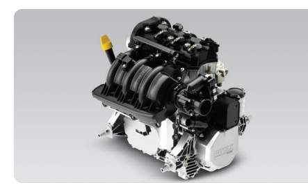
ROTAX<sup>®</sup> 900 ACE<sup>™</sup> - 90 The Rotax<sup>®</sup> 900 ACE<sup>™</sup> - 90 gives crisp acceleration with impressive fuel economy.