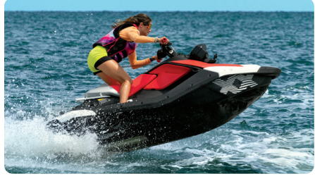
Extended Range VTS<sup>™</sup> (Variable Trim System) Offers double the range of the regular VTS<sup>™</sup> for greater ease when executing tricks.

Trixx Mode unlocks new water acrobatics like reverse donuts to add even more showstopping fun to the ride. The Trixx mode offers more thrust in reverse to perform manoeuvers more easily.