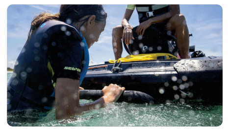
Boarding Ladder Makes boarding from the water easier and quicker.

©2024 Bombardier Recreational Products Inc., (BRP). All rights reserved. (a), TM and the BRP logo are trademarks of Bombardier Recreational Products Inc. or its affiliates. All product comparisons, industry and market claims refer to new sit-down PWC with 4-stroke engines. Watercraft performance may vary depending on, among other things, general conditions, ambient temperature, altitude, riding ability and rider/ passenger weight. Testing of competitive models done under identical conditions. Because of our ongoing commitment to product quality and innovation, BRP reserves the right at any time to discontinue or change specifications, price, design, features, models, or equipment without incurring any obligation. †Garmin is a trademark of Garmin Ltd. or its subsidiaries.