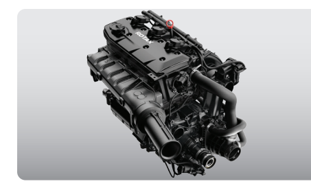
ROTAX® 1630 ACE™ - 170 Enjoy plenty of pep and great fuel economy with the 1630 ACE - 125kW (170 hp) version, the most powerful naturally aspirated engine in the Sea-Doo® lineup.

An innovative, industry-first system that allows you to free your pump of weeds and debris with intuitive handlebar-activated controls.