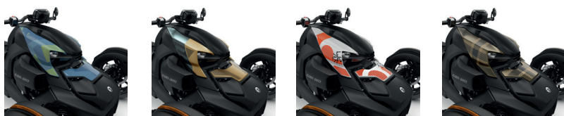
Urban Blue Atlantis Gold Cyber Orange Moka Plaid