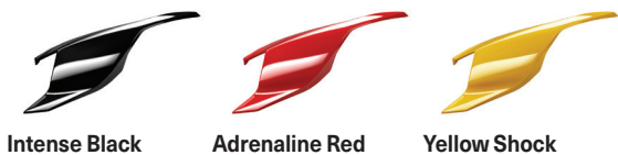
Intense Black Adrenaline Red Yellow Shock