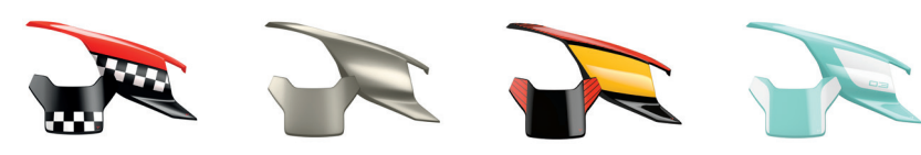
Racer Red Liquid Titanium Heritage Yellow Mint Freeze