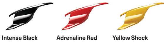
Intense Black Adrenaline Red Yellow Shock