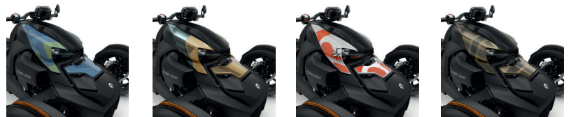
Urban Blue Atlantis Gold Cyber Orange Moka Plaid