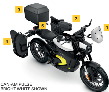
CAN-AM PULSE BRIGHT WHITE SHOWN